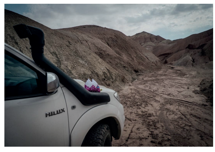
- Simon and Anette travel to Mongolia The goal is the daycare for disabled children. Needs are still discussed.